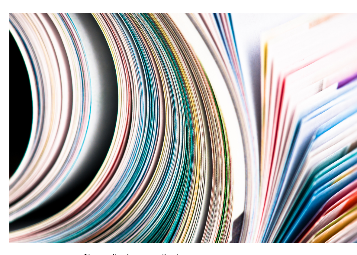
pressto • agentur für medienkommunikation

pressto gmbh • corneliusstraße 15 • 50678 köln fon +49.(0)2 21.88 88 58.0 • fax +49(0)2 21.88 88 58.88 info@pressto.de • www.pressto.de